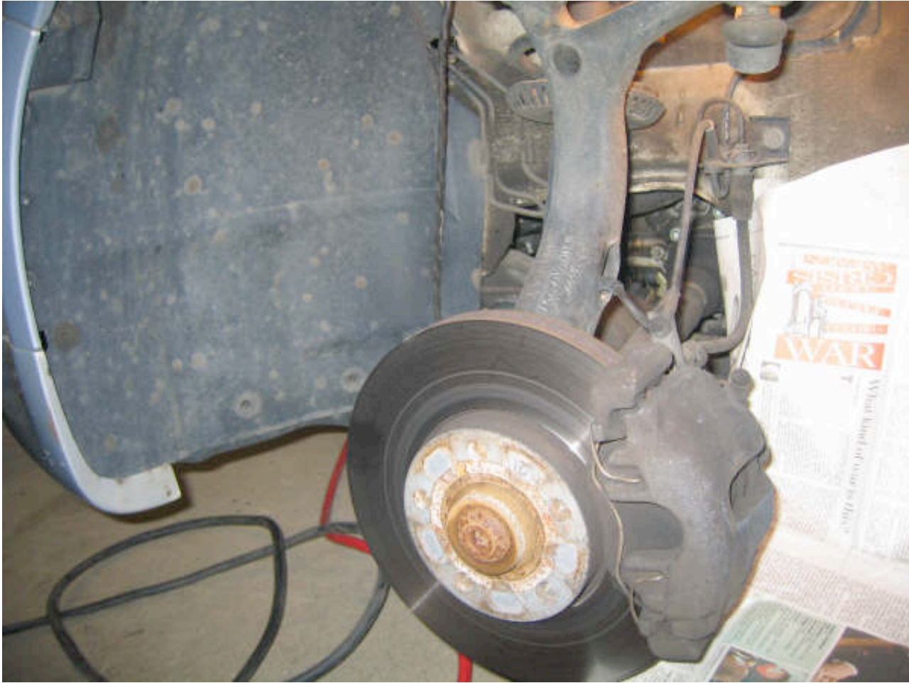
Rotors are black from the OEM pads....(I had mintex and I did change them)